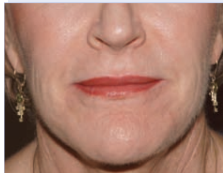
After 10 Months

Fillers are a great way to erase smile lines, nasolabial folds and wrinkles around your nose and mouth, but they can also be frustrating because some may last only a few months. Now comes Radiesse, a safe, new, FDA-approved filler that helps you maintain your youthful look for a year, or even longer. This is because Radiesse works below the skin's surface, where its tiny calcium-based microspheres