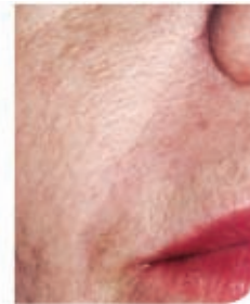
After 6 Months